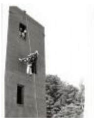
Rescue Training Session (100-01-03-0360)