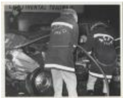
Traffic Accident (100-01-03-0376)