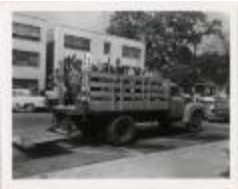
Truck Full of School Signs (100-03-01-0423)