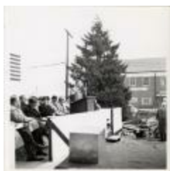
Courthouse Cornerstone Ceremony (100-03-01-0419)