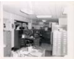
Courthouse Basement, South Wing, IBM section (100-03-01-0425)