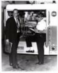
Inspecting an Ambulance (100-01-03-0378)