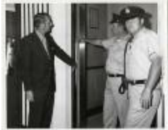
Firemen with Unidentified Man (100-01-03-0367)