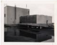
Air Conditioning Tower on the Courthouse Roof (100-03-01-0406)