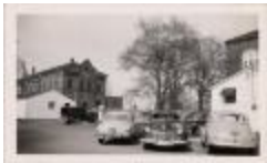
Arlington Court House and Jail (100-03-01-0410)