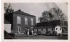
Arlington County Courthouse (100-03-01-0408)