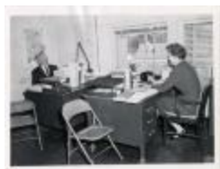
Court House Advanced Planning Section (100-03-01-0429)