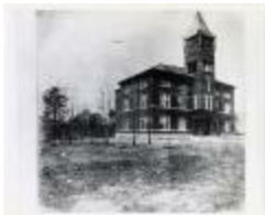
Arlington County Courthouse (100-03-01-0402)