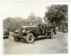
Fire Truck (100-01-03-8741)