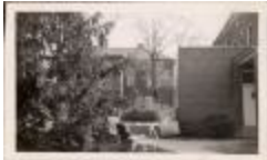
Arlington Court House and Jail (100-03-01-0409)