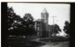
Arlington County Courthouse (100-03-01-0403)