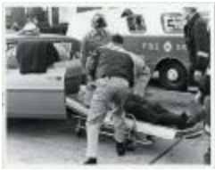
ACFD at an Accident Scene (100-01-03-0365)