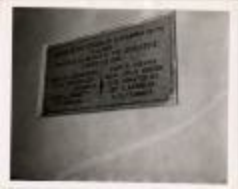
Historical Plaque in the Courthouse (100-03-01-0421)