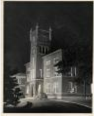
County Courthouse at Night (100-03-01-0420)