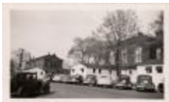
Arlington Court House and Jail (100-03-01-0411)