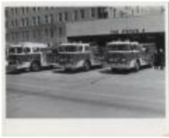
Fire Engines at Station No. 4 (100-01-03-0363)