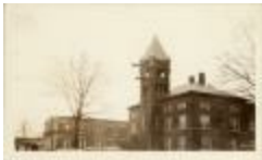
Arlington County Courthouse (100-03-01-0401)