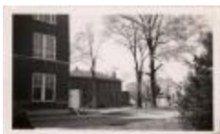
Arlington Court House and Jail (100-03-01-0417)