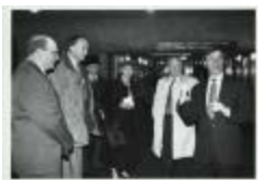
Crystal City Underground (100-01-02-0002)