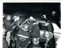
Car Wreck at Night (100-01-03-0362)