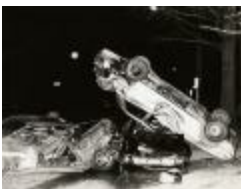
Auto Accident (100-01-03-0377)