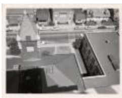
Courthouse Tower (100-03-01-0404)