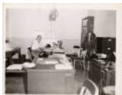
Courthouse Office Worker (100-03-01-0428)