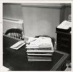
Courthouse Cornerstone Box Contents, 1961 (100-03-01-0424)