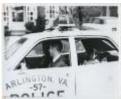
Family Ride-a-Long (100-01-08-0368)