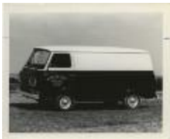
Police Van (100-01-08-0208)