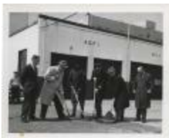
Fire Station #4 Groundbreaking (100-01-03-0238)