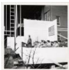
Courthouse Cornerstone Ceremony (100-03-01-0418)