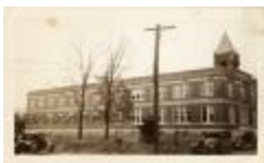
Arlington County Courthouse (100-03-01-0405)