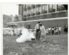
Nurses Receiving Fire Training (100-01-03-0359)