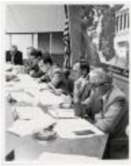
County Board Meeting (100-02-02-0390)