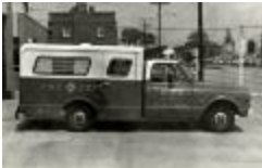
ACFD Ambulance (100-01-03-0366)