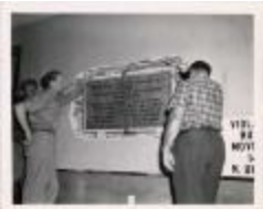
Plaque in the Old Courthouse Lobby (100-03-01-0422)