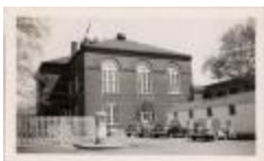
Arlington County Courthouse (100-03-01-0416)