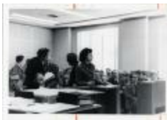
Courtroom Session Observers (100-01-07-0178)