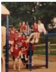
Red Top Cab Softball Team, 1990s (199-Red Top Cab Softball Team)