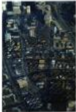
Aerial Photograph of Rosslyn with Handwritten Markings, 2002 (199-02-01-02-0002)