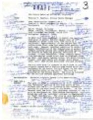
Draft Site Plan Amendment Request, Virginia Square Site, with Handwritten Notes, 1997 (199-01-03-02-0006)