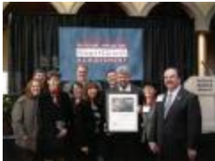
Arlington County Planning Committee, Winners of the 2002 National Award for Smart Growth Achievement (199-Smart Growth Achievement)