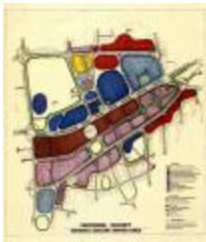
"Preferred Concept, Virginia Square Metro Area," 2001 (199-02-03-01-0004)