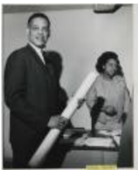
"A Day at the Office -- Working Together" (196-0022)