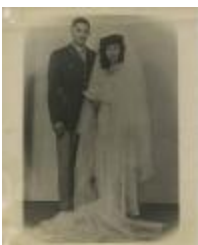
Wedding Day, 1945 (196-01-0005)