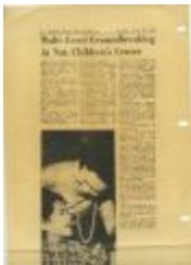
Northern Virginia Sun March 23, 1972 "Syphax Groundbreaking National Children's Center" (196-03-23-1972)