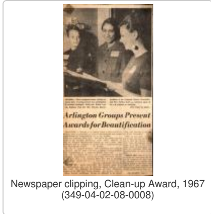
Newspaper clipping, Clean-up Award, 1967 (349-04-02-08-0008)