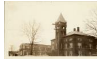
Arlington County Courthouse (100-03-01-0401)