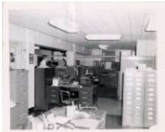
Courthouse Basement, South Wing, IBM section (100-03-01-0425)