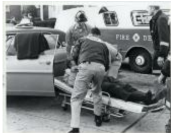
ACFD at an Accident Scene (100-01-03-0365)