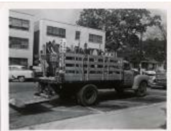
Truck Full of School Signs (100-03-01-0423)