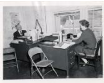
Court House Advanced Planning Section (100-03-01-0429)