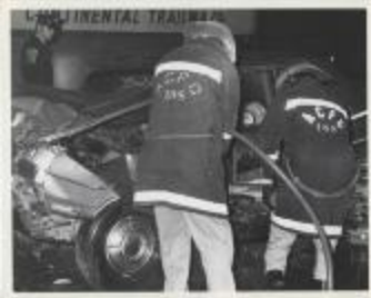
Traffic Accident (100-01-03-0376)