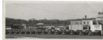
Patrol Cars of the APD (100-01-08-0307)