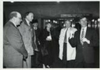
Crystal City Underground (100-01-02-0002)