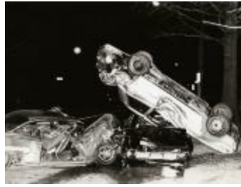
Auto Accident (100-01-03-0377)