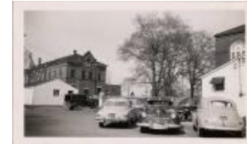
Arlington Court House and Jail (100-03-01-0410)