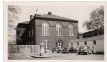
Arlington County Courthouse (100-03-01-0416)