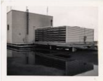
Air Conditioning Tower on the Courthouse Roof (100-03-01-0406)