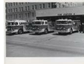
Fire Engines at Station No. 4 (100-01-03-0363)