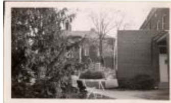
Arlington Court House and Jail (100-03-01-0409)