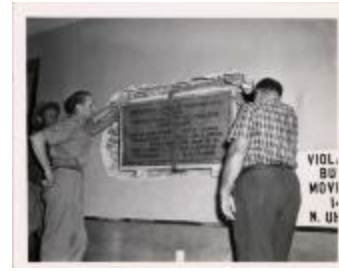
Plaque in the Old Courthouse Lobby (100-03-01-0422)