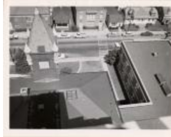
Courthouse Tower (100-03-01-0404)