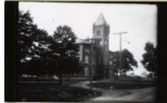
Arlington County Courthouse (100-03-01-0403)