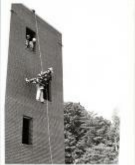
Rescue Training Session (100-01-03-0360)