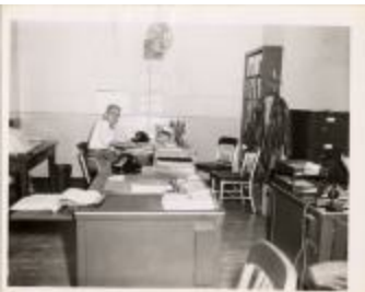
Courthouse Office Worker (100-03-01-0428)