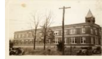
Arlington County Courthouse (100-03-01-0405)