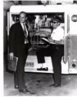
Inspecting an Ambulance (100-01-03-0378)