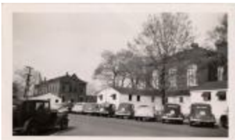
Arlington Court House and Jail (100-03-01-0411)