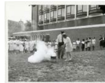
Nurses Receiving Fire Training (100-01-03-0359)