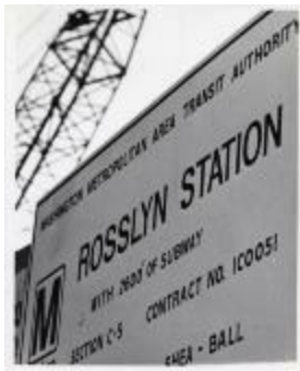
Rosslyn Metro Station Construction Sign (100-01-13-0266)