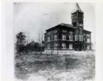
Arlington County Courthouse (100-03-01-0402)