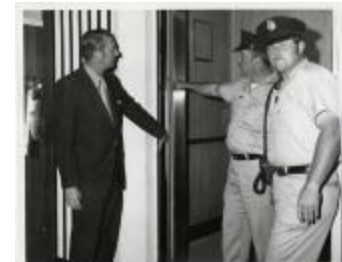
Firemen with Unidentified Man (100-01-03-0367)