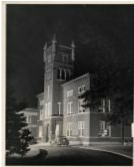
County Courthouse at Night (100-03-01-0420)