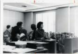
Courtroom Session Observers (100-01-07-0178)