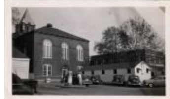
Arlington County Courthouse (100-03-01-0408)