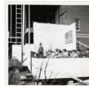
Courthouse Cornerstone Ceremony (100-03-01-0418)