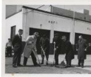
Fire Station #4 Groundbreaking (100-01-03-0238)