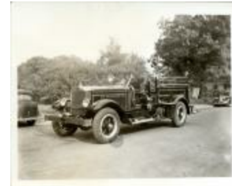
Fire Truck (100-01-03-8741)