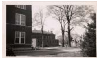
Arlington Court House and Jail (100-03-01-0417)