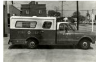
ACFD Ambulance (100-01-03-0366)