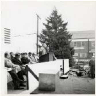
Courthouse Cornerstone Ceremony (100-03-01-0419)