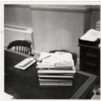
Courthouse Cornerstone Box Contents, 1961 (100-03-01-0424)