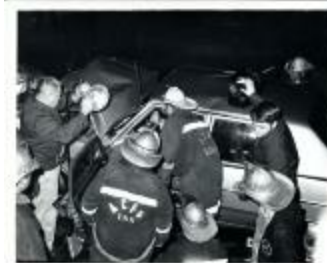
Car Wreck at Night (100-01-03-0362)