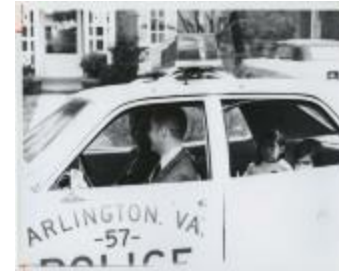
Family Ride-a-Long (100-01-08-0368)