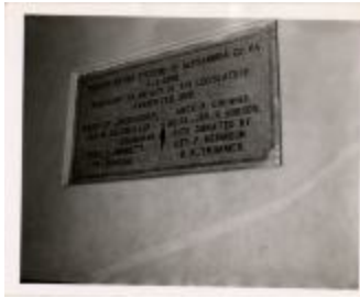
Historical Plaque in the Courthouse (100-03-01-0421)