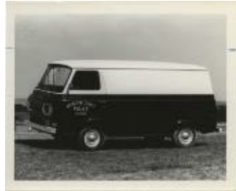
Police Van (100-01-08-0208)