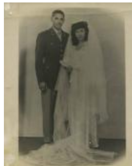
Wedding Day, 1945 (196-01-0005)