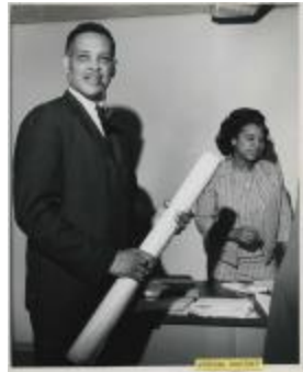
"A Day at the Office -- Working Together" (196-0022)