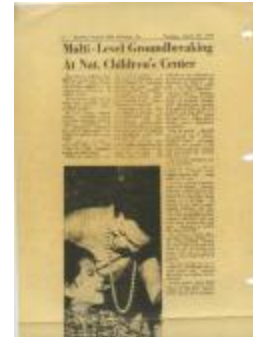
Northern Virginia Sun March 23, 1972 "Syphax Groundbreaking National Children's Center" (196-03-23-1972)