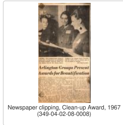
Newspaper clipping, Clean-up Award, 1967 (349-04-02-08-0008)