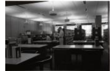
Reading Room of the Center for Local History (250-04-01-2911)