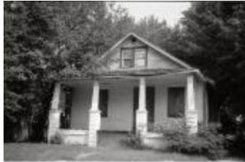
4007 11th Street North (250-05-01-3556)