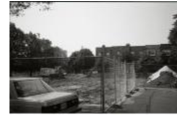
Construction on Quincy Street (250-05-01-3555)