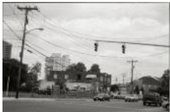
Wilson and North Quincy (250-05-01-3560)