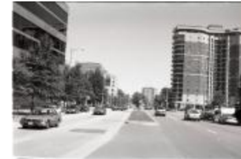
Fairfax and North Oakland (250-09-01-8790)