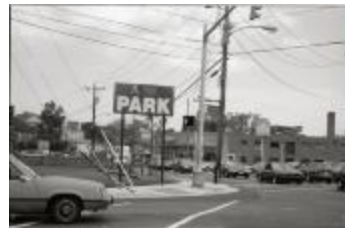
Altman's Parking (250-05-01-3562)