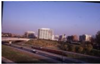
I-66 in Ballston (210-0002)