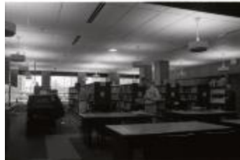
Reading Room of the Center for Local History (250-04-01-2909)