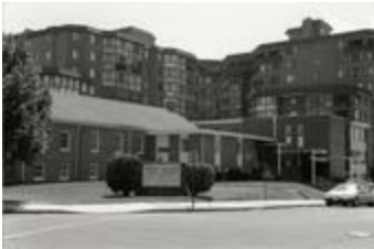
First Baptist Church of Ballston, 1996 (202-6064)