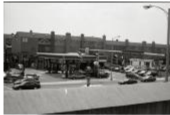
Exxon Gas Station (250-05-01-3549)