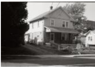
1110 and 1116 Quincy Street North (250-02-01-1323)