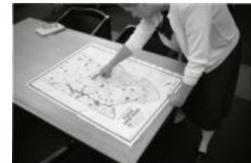
Using Center for Local History Maps (250-04-01-2915)