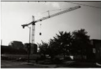
George Mason University (250-02-01-1326)