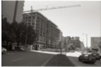
Construction on Fairfax Drive (250-09-01-8791)