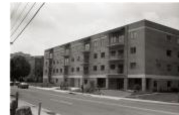
Apartments at 1160 North Quincy (250-09-01-8777)