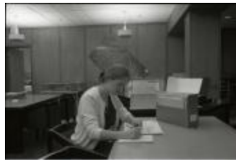
A Researcher in the Center for Local History (250-04-01-2913)