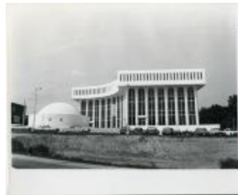
Arlington Planetarium (214-04-09-9379)