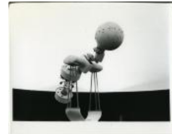
Planetarium Projector at Arlington Planetarium (214-04-09-9384)