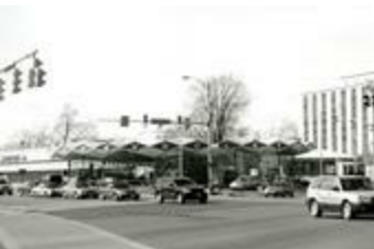
Bob Peck Chevrolet, front street view, 2006 (202-6424)