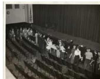
Tuberculosis testing at Washington & Lee High School, 1941 (21-5398)