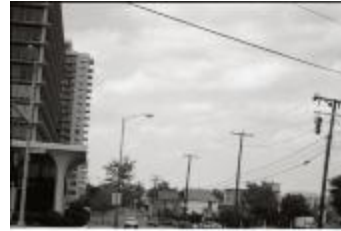
Wilson and North Quincy (250-3561)