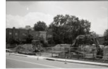
Demolition of 1110 and 116 Quincy Street (250-05-01-3543)