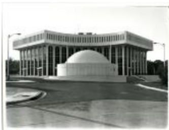
Arlington Planetarium (214-03-08-9335)