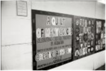
County Art Project "A Quilt of Many Colors" (250-02-01-1330)