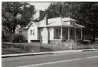
1110 and 1116 Quincy Street North (250-02-01-1322)