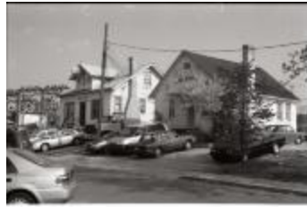
Arlington Imports Used Cars (250-02-01-1327)