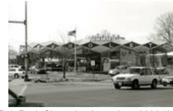
Bob Peck Chevrolet, front view, 2006 (202-6422)