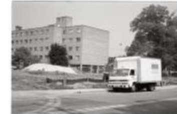
Dominion Truck on Site (250-05-01-3559)