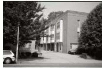
Townhomes for Rent (250-05-01-3553)