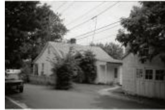
1040 Quincy Street (250-05-01-3546)