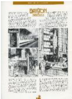
Mixed-Use Developments Ballston Metro Center ( 76-05-02-02-0010)