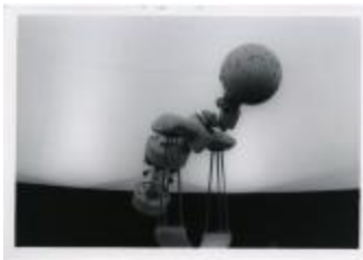
Planetarium Projector at Arlington Planetarium (214-04-09-9382)