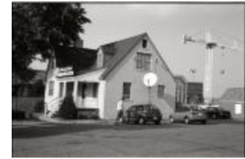
Enterprise Rent-a-Car (250-02-01-1329)