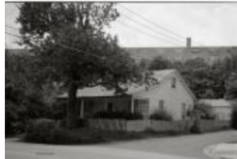
1040 Quincy Street (250-05-01-3545)