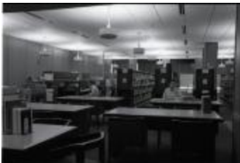
Reading Room of the Center for Local History (250-04-01-2912)