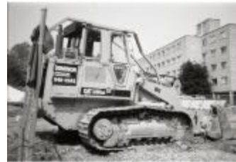
Dominion Front Loader on Site (250-05-01-3558)