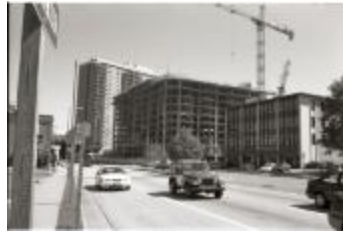
Construction on Fairfax Drive (250-09-01-8792)