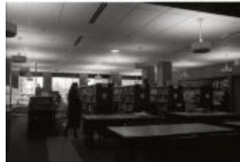
Reading Room of the Center for Local History (250-04-01-2910)