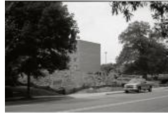
Demolition of 1110 and 116 Quincy Street (250-05-01-3542)