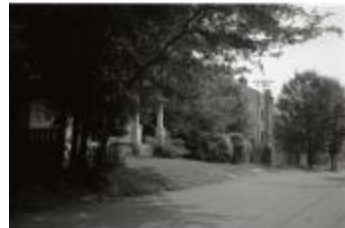
11th Street North (250-05-01-3557)