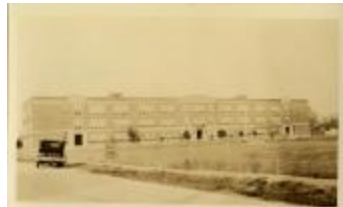
Washington-Lee School Building (32-07-08-01-0154)