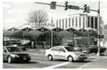
Bob Peck Chevrolet, front view, 2006 (202-6425)