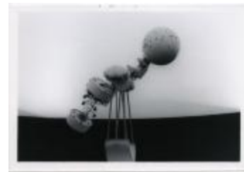
Planetarium Projector at Arlington Planetarium (214-04-09-9380)