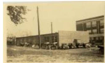
Washington-Lee Manual Training Building (32-07-08-01-0155)