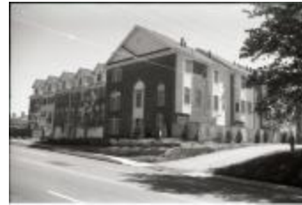
Townhouses in Ballston (250-09-01-8787)