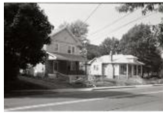
1110 and 1116 Quincy Street North (250-02-01-1324)