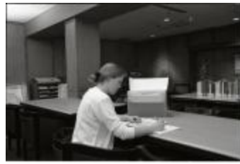
A Researcher in the Center for Local History (250-04-01-2914)