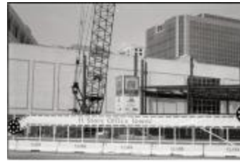
Hecht Company Office Tower Construction (250-05-01-3550)