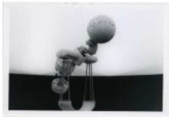
Planetarium Projector at Arlington Planetarium (214-04-09-9381)