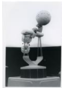
Planetarium Projector at Arlington Planetarium (214-04-09-9383)