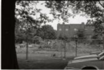
Demolition of 1110 and 116 Quincy Street (250-05-01-3544)