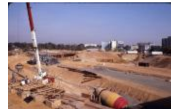
Construction of I-66 in Ballston (210-0001)