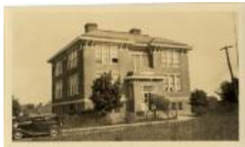
Thomas Nelson Page School Building (32-07-08-01-0153)