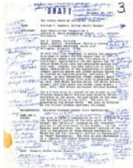
Draft Site Plan Amendment Request, Virginia Square Site, with Handwritten Notes, 1997 (199-01-03-02-0006)