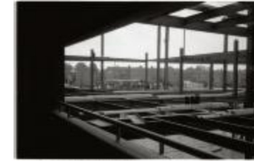
Hecht Company Office Tower Construction (250-05-01-3547)