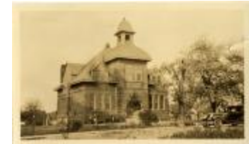
Old Ballston Public School Building (32-07-08-01-0134)