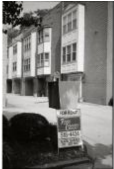
For Rent (250-05-01-3552)