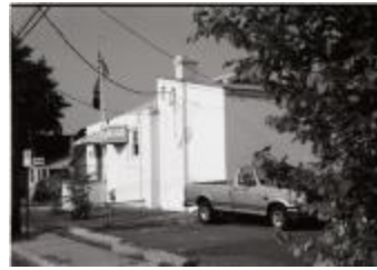
American Legion, Billy Mitchell Post (250-02-01-1328)