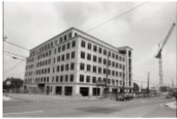
Number One Virginia Square (250-09-01-8778)