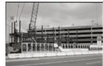
Hecht Company Office Tower Construction (250-05-01-3551)