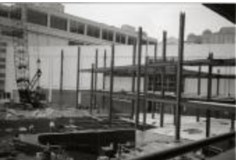
Hecht Company Office Tower Construction (250-05-01-3548)