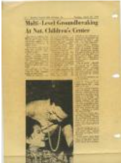
Northern Virginia Sun March 23, 1972 "Syphax Groundbreaking National Children's Center" (196-03-23-1972)