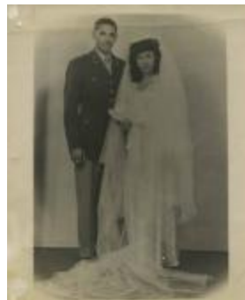
Wedding Day, 1945 (196-01-0005)